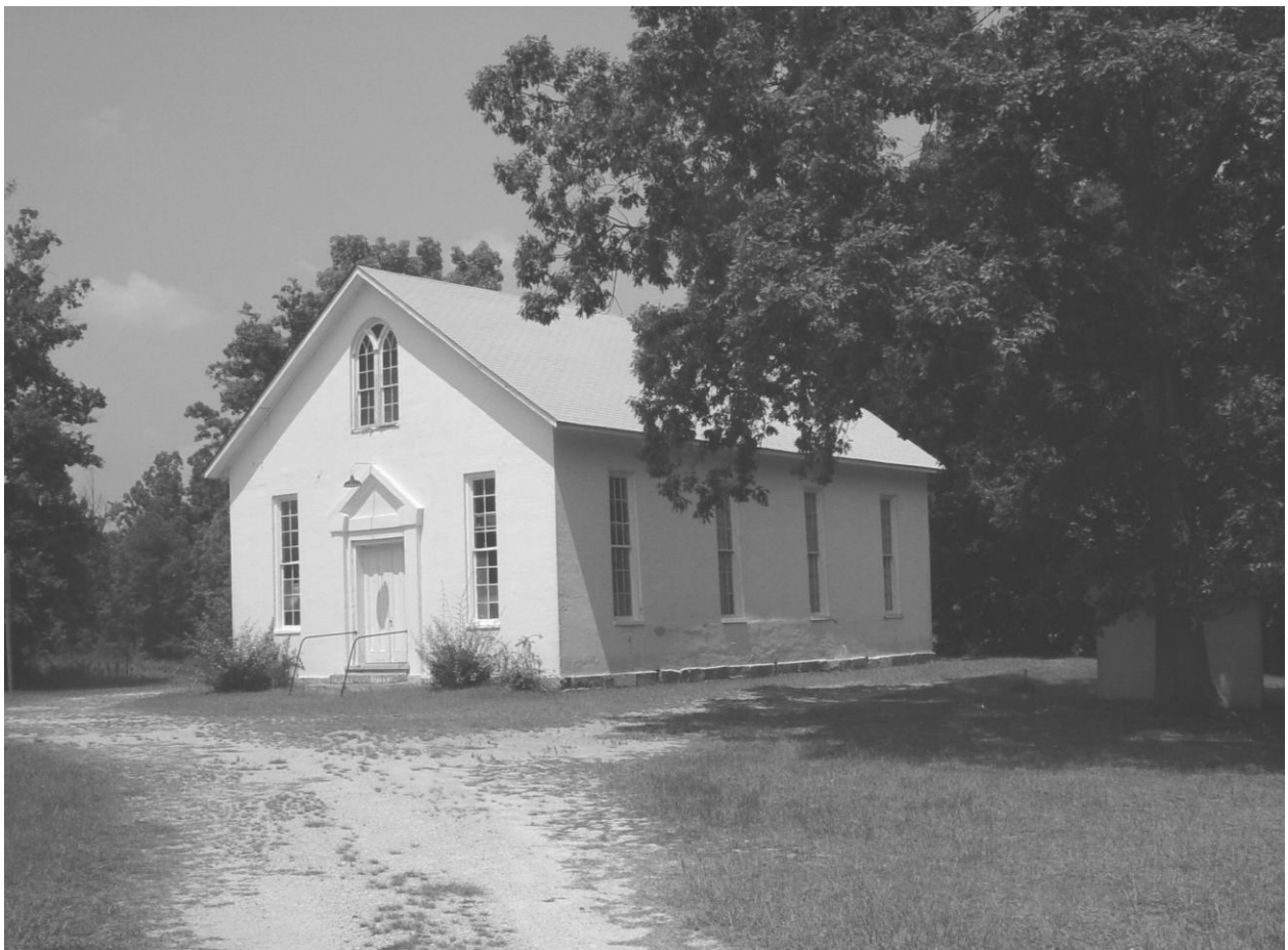
Mt. Olivet Presbyterian Church

(Church Cemeteries in the Eastern Section of the County)